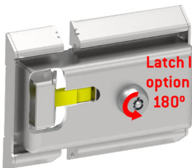
Latch lock option 180°

Latch lock option. This system allows the latch to be locked after turning the key 180° to the left.